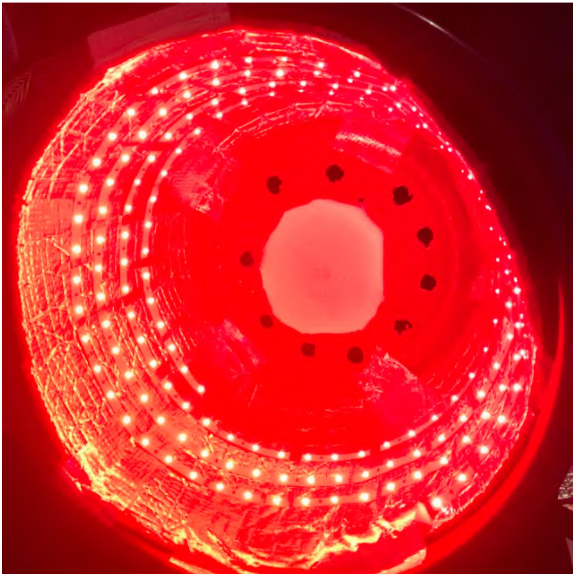
Figure 2. Photograph of the “light bucket” described by Hamilton et al. [24].

Additional clinical trials are in progress that, in addition to applying light to the head also apply light to the abdomen, with the goal of improving the gut microbiome. The results are eagerly awaited.